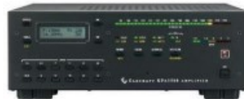
The K4 interfaces seamlessly with the KPA500 and KPA1500 amplifiers

"The performance of their products is only eclipsed by their service and support. Truly amazing!" Joe - W1GO