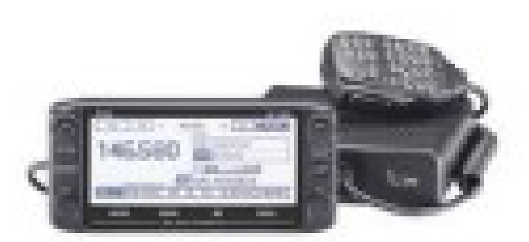
ID-5100A Deluxe VHF/UHF Dual Band Digital Transceiver