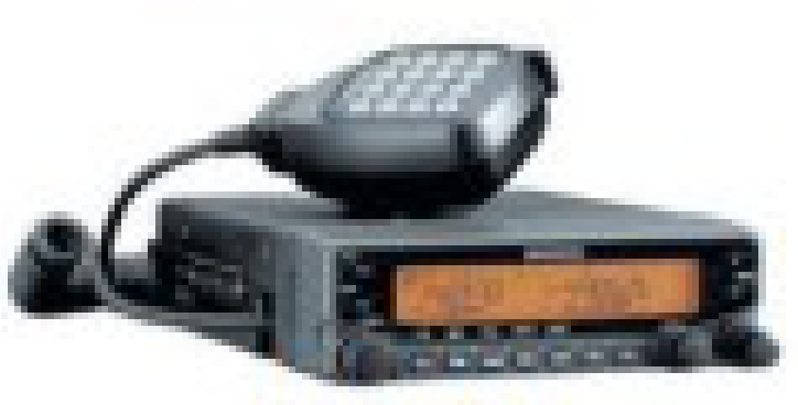
TM-V71A 2M/440 DualBand