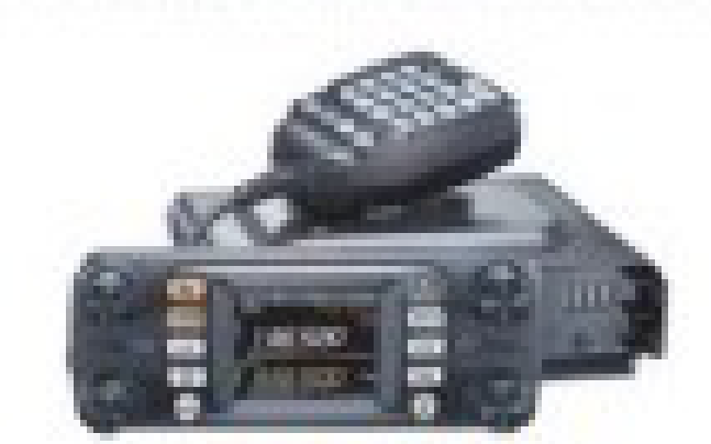
FTM-300DR C4FM/FM 144/430 MHz Dual Band