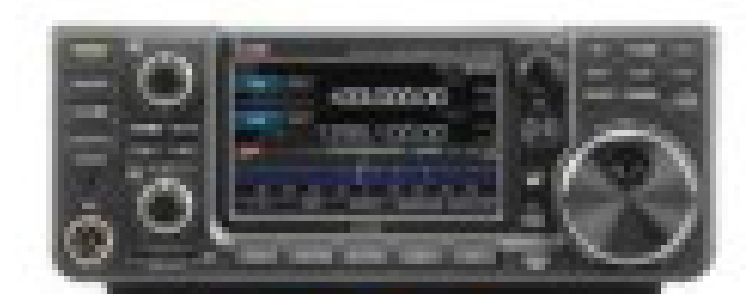
IC-9700 All Mode Tri-Band Transceiver