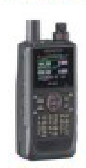
TH-D74A 2M/220/440 HT