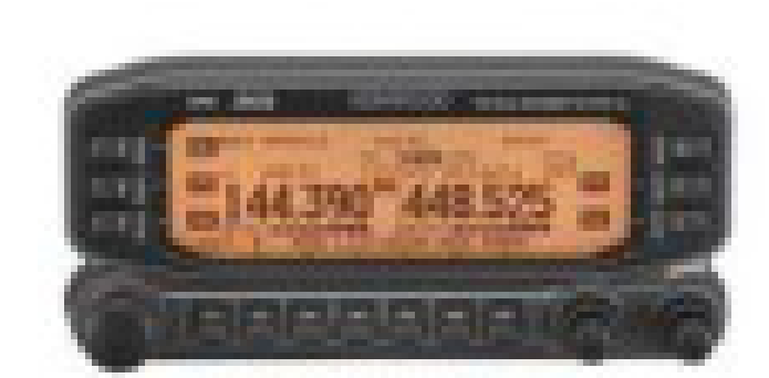
TM-D710G 2M/440 Dualband