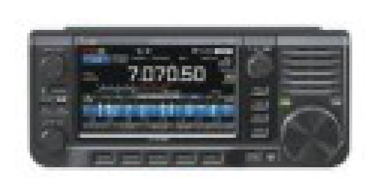
IC-705 HF/50/144/430 MHz All Mode Transceiver