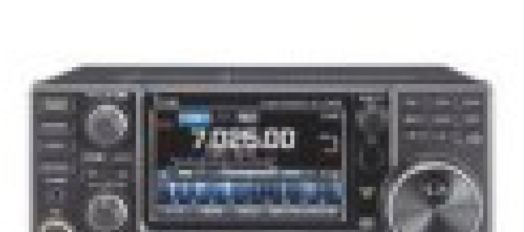
IC-7300 HF Transceiver