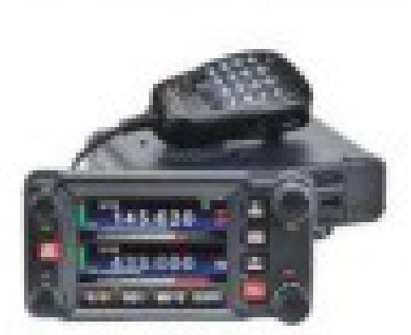
FTM-400XD 2M/440 Mobile