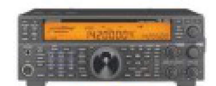
TS-590SG HF/50MHz Transceiver