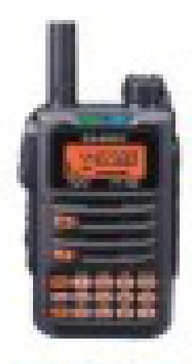
FT-70DR C4FM/FM 144/430 Xcvr