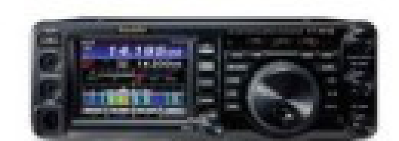
FT-991A HF/VHF/UHF Transceiver