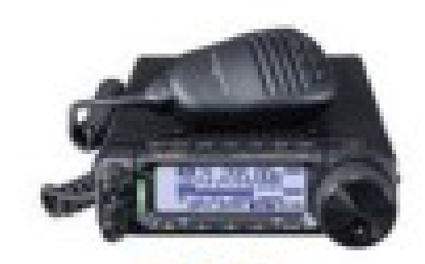
FT-891 HF+50 MHz All Mode Transceiver