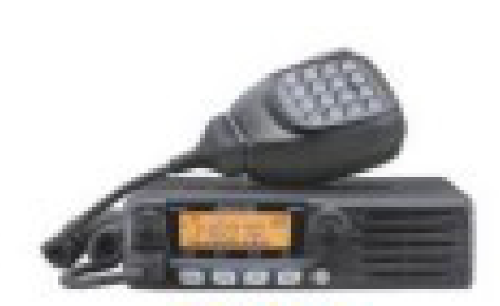
TM-281A 2 Mtr Mobile