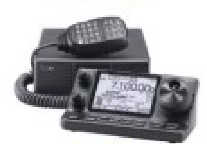
IC-7100 All Mode Transceiver