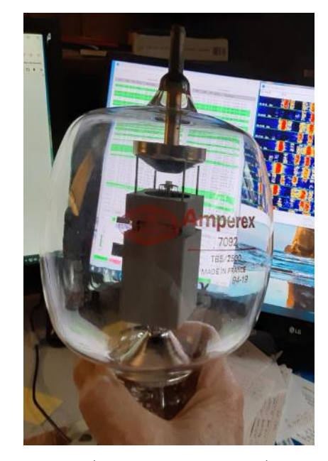
The 7092 Triode Dimensions 10 x 6 inches. Note unusual square plate.

The 7092 was made for some decades. Amperex in France supplies a very complete data sheet for this tube. Because the tube was made for industrial purposes that do not require that the DC voltages be filtered, the data is separated into sections for use with unfiltered single-phase supplies and unfiltered 3 phase supplies. I am unsure what the ratings would be if a filtered DC supply was used, but I would guess that 4 to 5 KV should perform well in a ham amplifier. The only mechanical problem is the base that requires cable clamp type attachments on the electrodes especially for the filaments running at 32.5 amps.