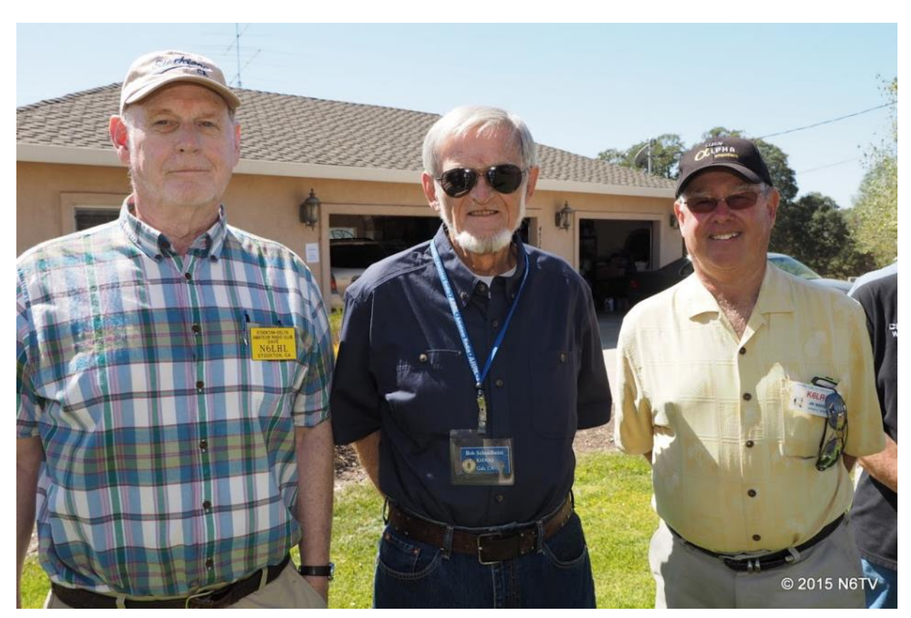
N6LHL, K6DGQ, K6LR