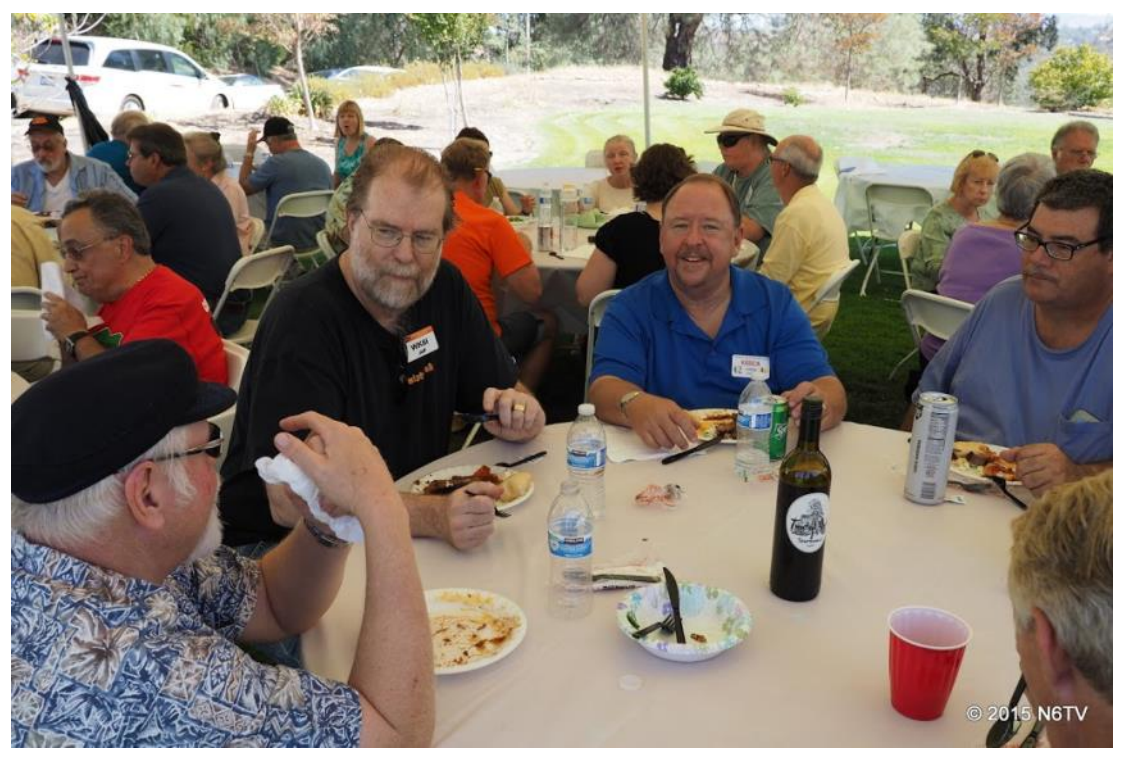
K6BEW, WK6I, K6SCA, KG6SVF