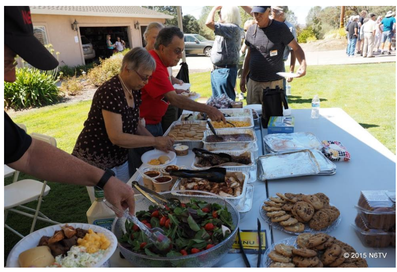
Dickey's BBQ -- great chow!