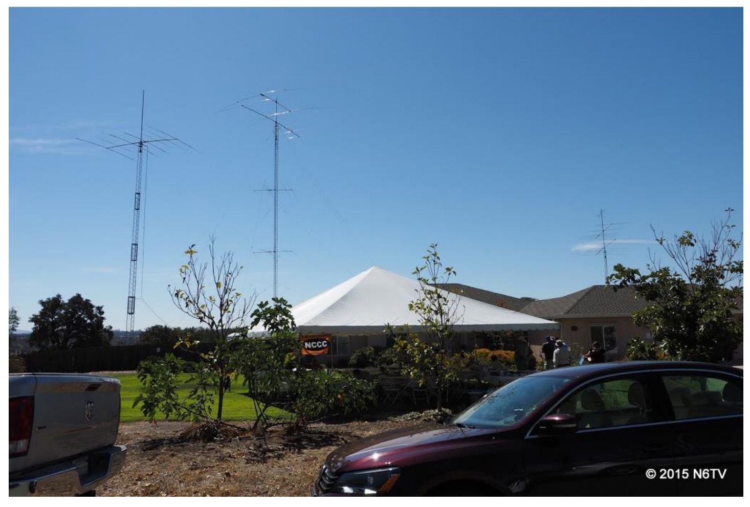
QTH of WC6H, Host of the BBQ