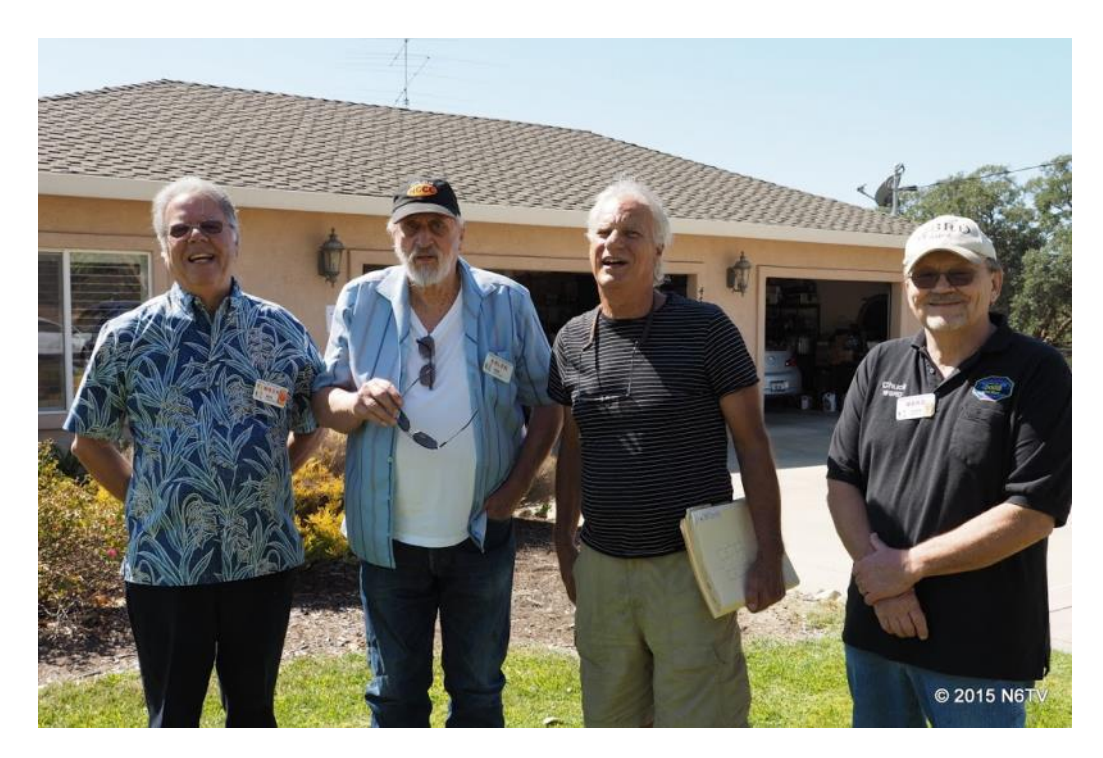
W6SR, K6LRN, K6SRZ, W6RD