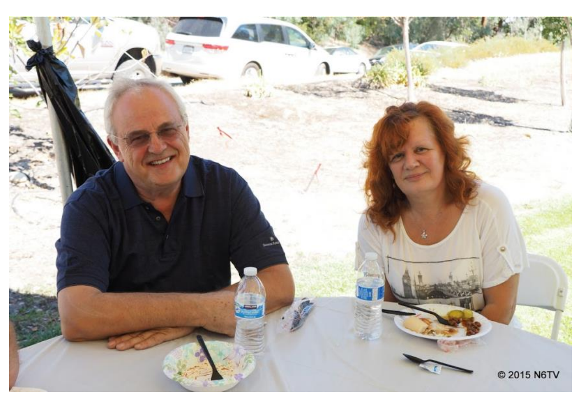
K6AAM/9A2AW and XYL