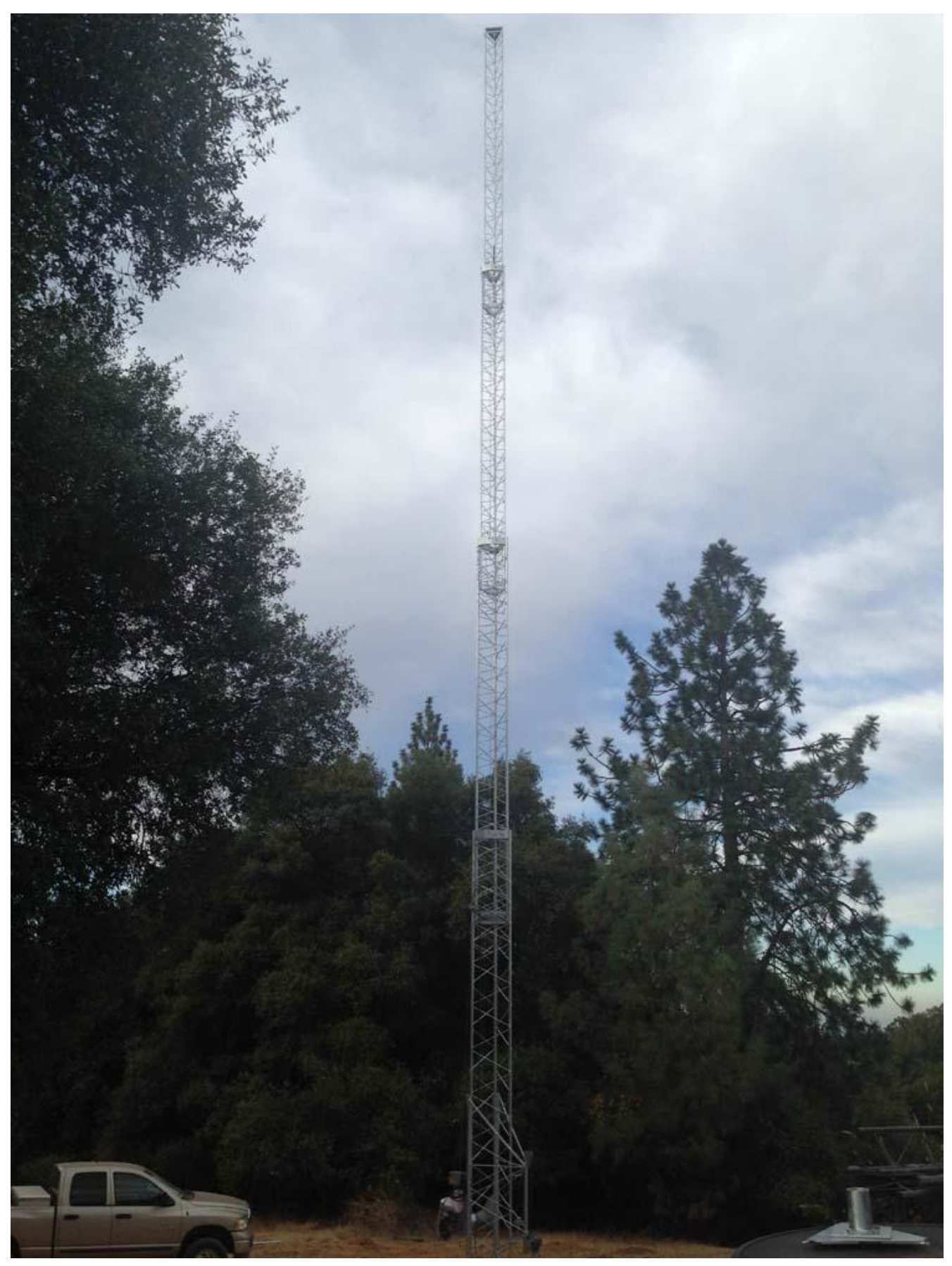
K6SCA's New Tower