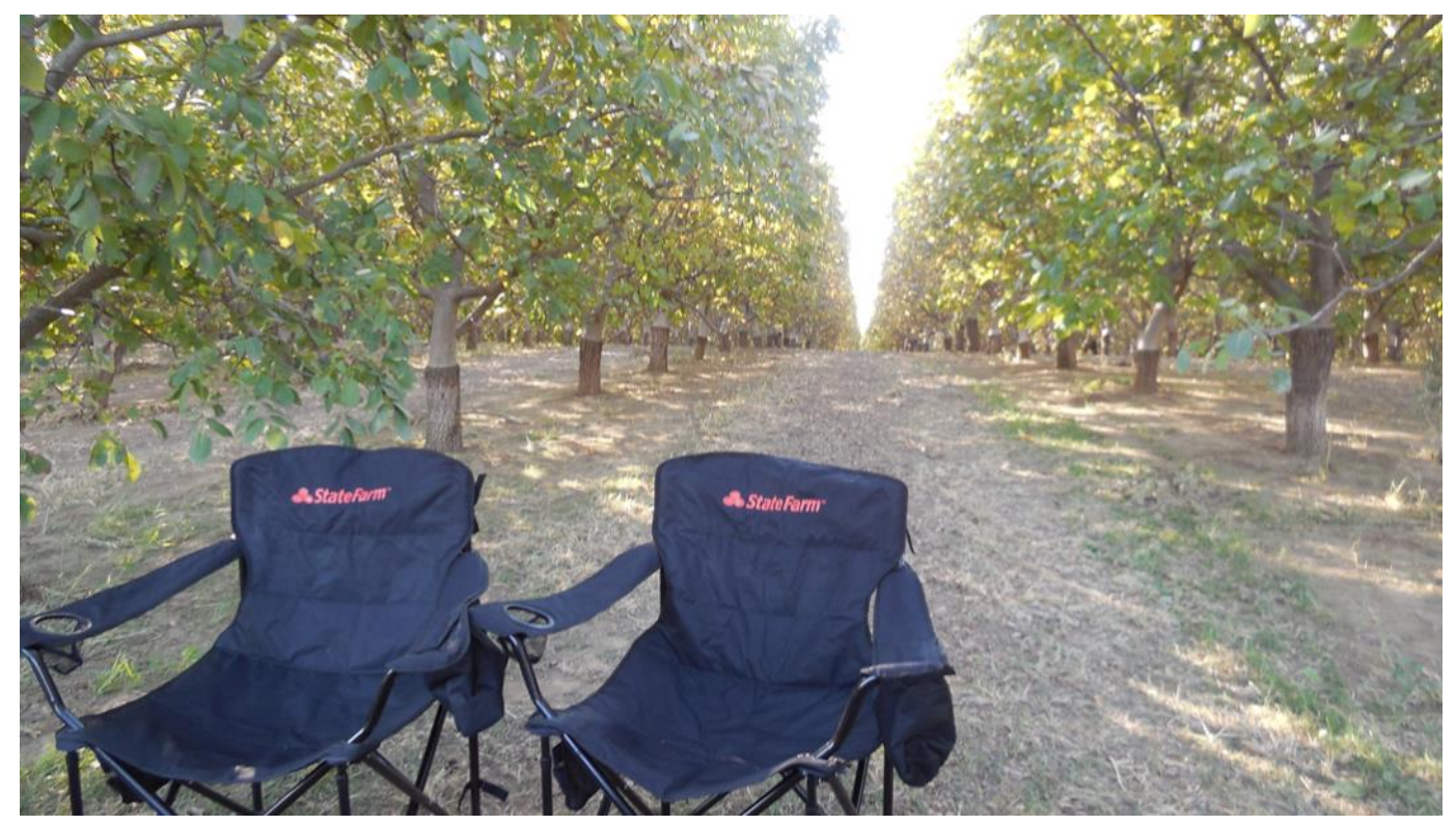
View of the Orchard

I went to sleep about 0630 UTC when the Q rate dropped off and I was starting to shiver; my core temperature was dropping a bit. After about ten minutes in my retired US Army medium cold sleeping bag, I was warm and asleep. Knowing how to stay warm, dry and be comfortable outdoors is important.