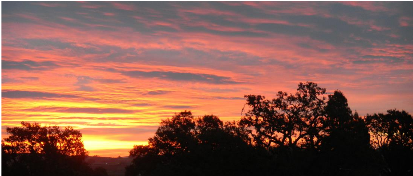
Long path sunrise from K6SRZ