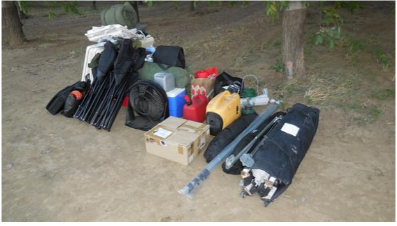
Gear on ground

For the past few years Ralph and I had been setting up our K6Y station over there, each year doing improvements to the station to increase our score all the while keeping it fun. CQP 2013 was the third year at the site and with the addition of a three element Super Antenna<sup>™</sup> YP-3 beam K6Y had a claimed score that jumped over 40% to just over 68,000 with 477 contacts and 56 mults missing only MS and NT for a sweep.