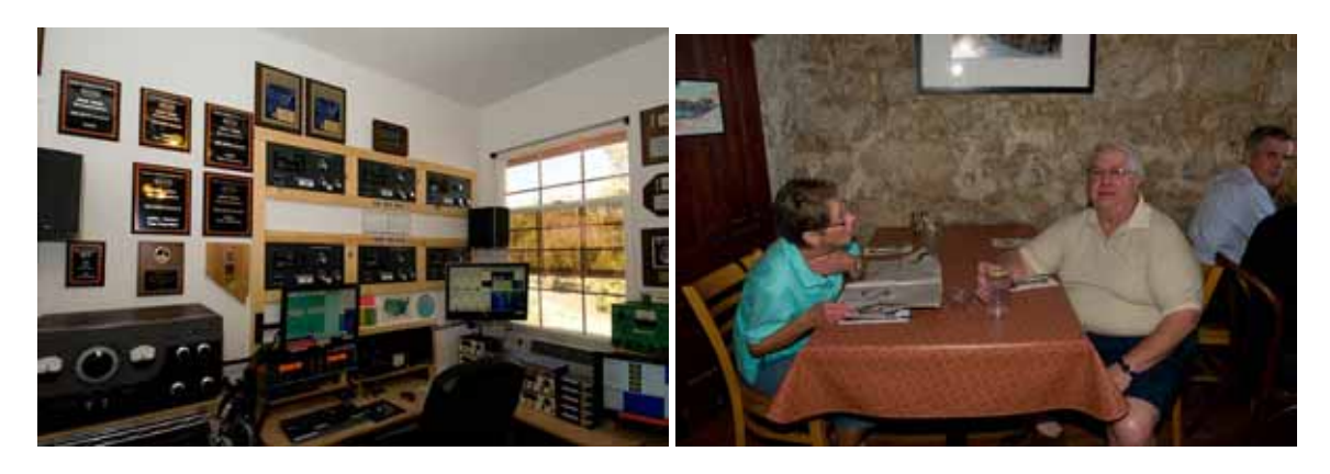
The shack at K5RC/W7RN