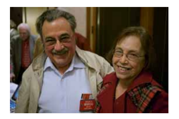
W6RGG & KB6IBX