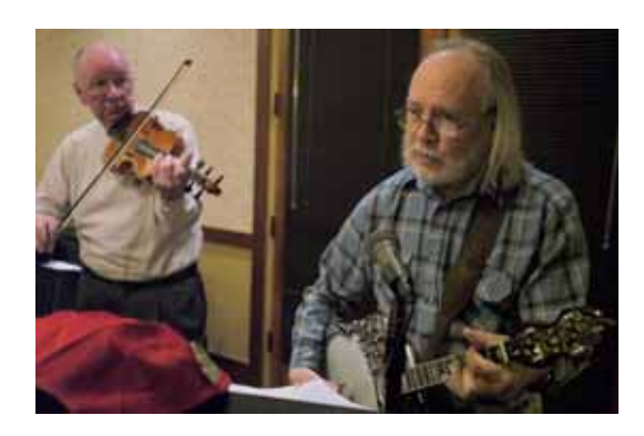
The Entertainment: K6RC and N6RO