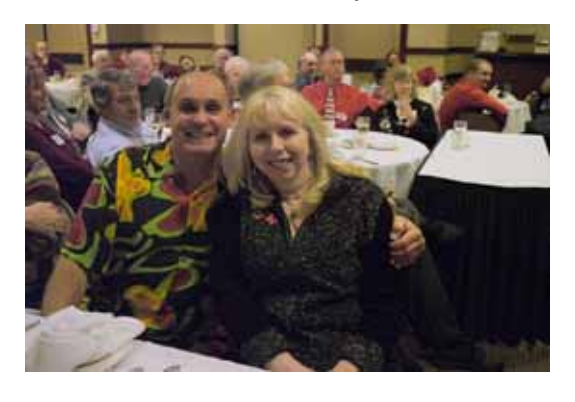
K6VVA and KE6BEQ