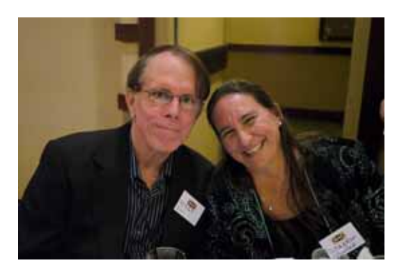
KE6QR and KI6ARW