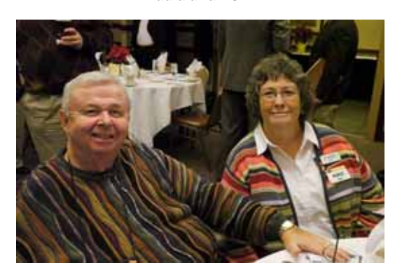
K6TA and K6KO