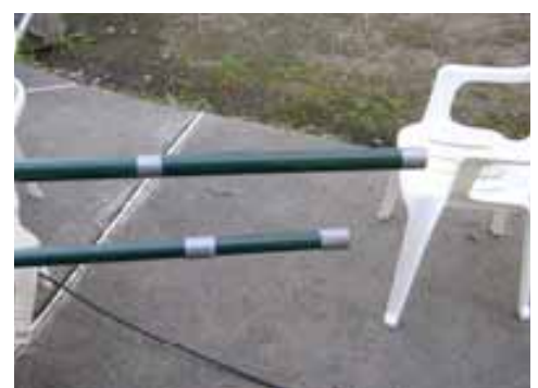
1" PVC and 1-1/2" PVC Wrapped and Ready For Assembly

Step 3. With the 1" PVC section, wrap a second section of the PVC with duct tape between 9-1/2" and 11-1/2" from the bottom.Note: Use enough duct tape to ensure a good telescoping fit is created between PVC sections when assembled.