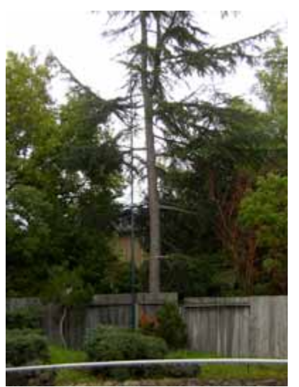
Antenna against fence to left of the pine tree

After bolting the PVC sections together, attach the capacitance hat (don't forget the wire-toantenna binding post connection). Place the bottom 2" PVC cap/plywood base in the ground where you want the antenna to stand. Raise the 27 ft. antenna, bracing the bottom against the ground. Carry the antenna to the plywood base and set it into the PVC cap. One person can carry/mount the antenna but two people makes it easier. Guy or brace according to your needs.