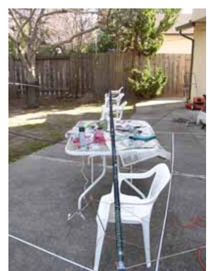
Antenna Wire Wrapping All 3 Sections Wire-Wrapped

at the top and bottom 180 deg apart (to keep the wire from falling off the can as it was being wound), my XYL "unwound" the wire from the spool, while I wound it onto the coffee can. 50x across the kitchen table = 250' + an additional 6' 5" did it. Cut the wire, adding a few extra inches for experimentation, but keep the 256' 5" point marked: that length worked for me.