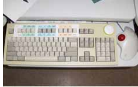
Small KVM control button mounted in upper right corner of keyboard.