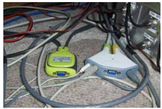
Two models of KVM switches: left one uses double Scroll key presses, right one uses small push button.

Still a work in progress, but if you use two or more computers (there are 4-computer KVMs as well!), you may want to try out this approach.