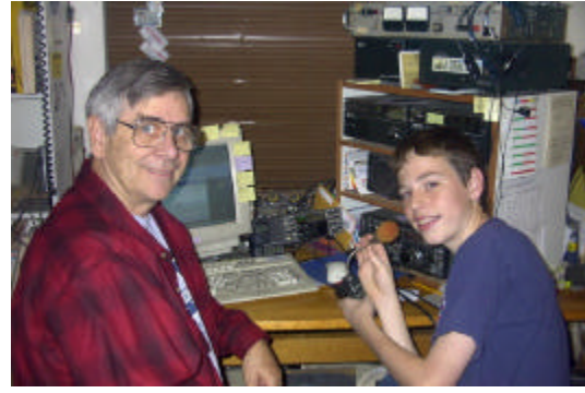
K6III & KG6JED