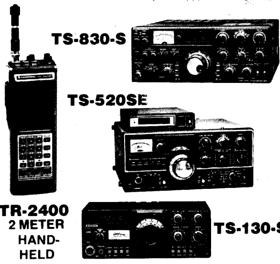
TR-2400 2 METER HAND- HELD