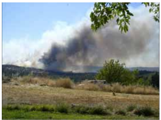
Picture caption - My back yard view of the fire shortly after it started. The black smoke on the left is the new Harley Davidson shop in flames and the heavier black smoke is 50 houses burning. You can see the spotter plate at the top of the picture while a borate bomber skims over the top of the trees way below at the head of the fire.

A fire started and within minutes, over 50 houses were consumed a very short distance from K6DGW, WX6V and KF6T. Thanks to a major effort by the fire crews, it was stopped before hitting the heavy timber uphill.