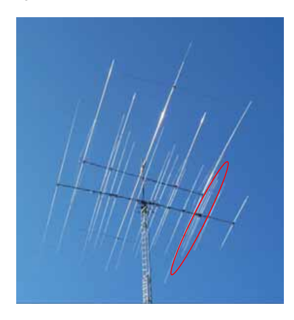
The red circle shows the 12/10 meter cell. Note how close those elements are to one another.

one of the 10 meter element tips to brush against the 12 meter element.