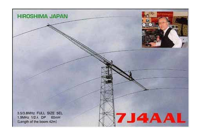
A full-size, 5 element, 80 meter yagi (Drool).

The moral of the story is improvise and optimize. Fix problems that should have been fixed during the antenna design phase. And, optimize your time and cost by fixing all your problems at one time.