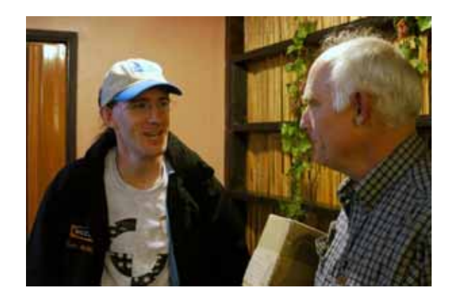
N6ML and W0YK