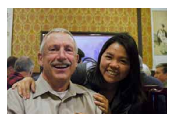
W6OAT and former employee