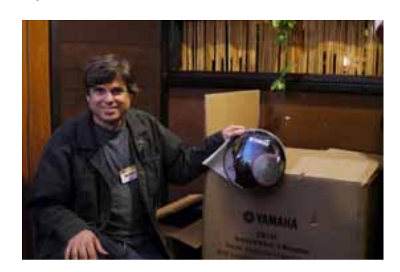
W6XU and lots of CM500 headsets