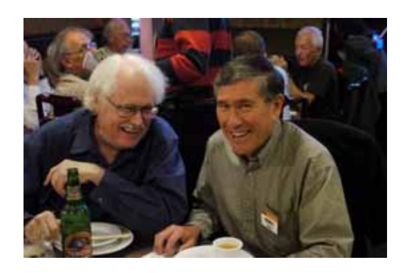
K9YC and N6BV