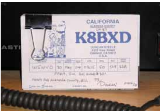
Stack of 6 meter CA County QSLs