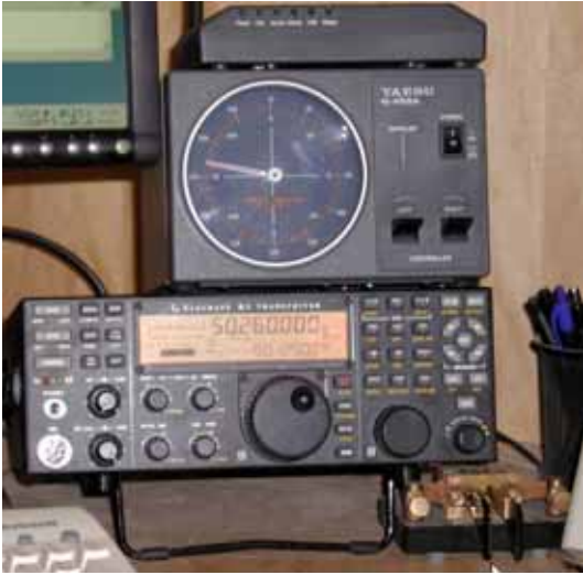
K3 at W5WVO set on 6 meters