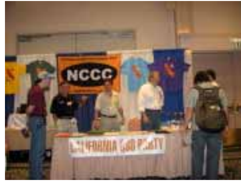
K6IAM, N6BV, K6XX, K6MM