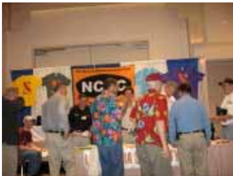
"Where Do I Sign?"