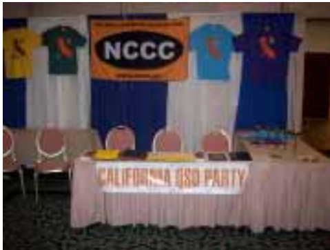
Ready For Business