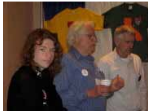
KG6YMN, K9YC, K6IC