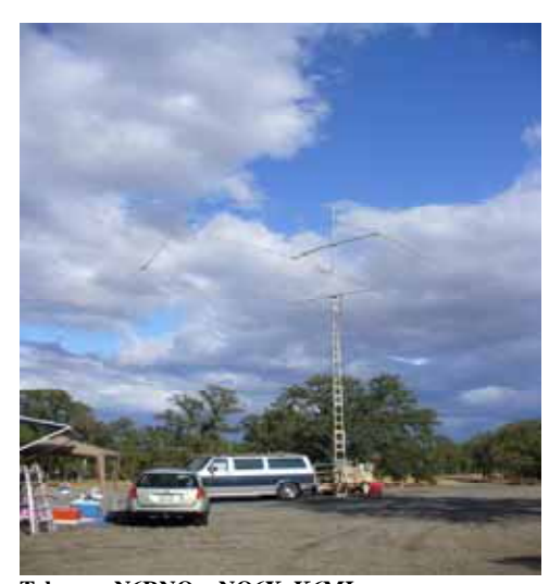
Tehama: N6RNO = NO6X, K6MI, WB6HYD, N3ZZ, K6VLF