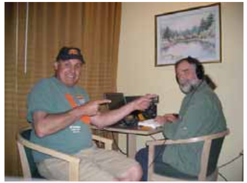
Kings = K6VVA & NI6T