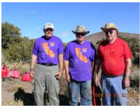
Alpine: N6A = K6DGW, W4UAT, W6OA, KQ6DI, KF6VU