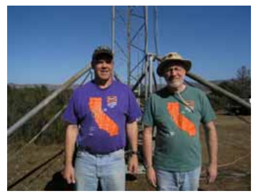
Monterey: N6RC & K6TD