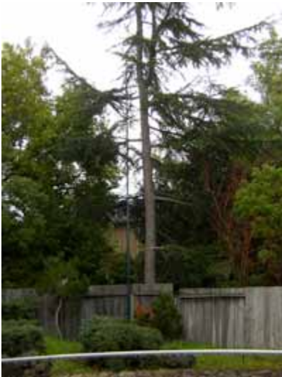
Antenna against fence to left of the pine tree

After bolting the PVC sections together, attach the capacitance hat (don't forget the wire-to-antenna binding post connection). Place the bottom 2" PVC cap/plywood base in the ground where you want the antenna to stand. Raise the 27 ft. antenna, bracing the bottom against the ground. Carry the antenna to the plywood base and set it into the PVC cap. One person can carry/mount the antenna but two people makes it easier. Guy or brace according to your needs.