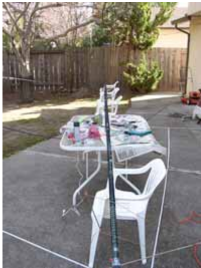
Antenna Wire Wrapping All 3 Sections Wire-Wrapped

Prepare a 1/2-wavelength length of wire for your desired center frequency. I chose 1.825 MHz. Using the formula 468/1.825 = 256' 5'' of wire. Using our kitchen table, which measured 5 ft long and a large coffee can with 2 large screws protruding from sides at the top and bottom 180 deg apart (to keep the wire from falling off the can as it was being wound), my XYL "unwound" the wire from the spool, while I wound it onto the coffee can. 50x across the kitchen table = 250' + an additional 6' 5" did it. Cut the wire, adding a few extra inches for experimentation, but keep the 256' 5" point marked: that length worked for me.