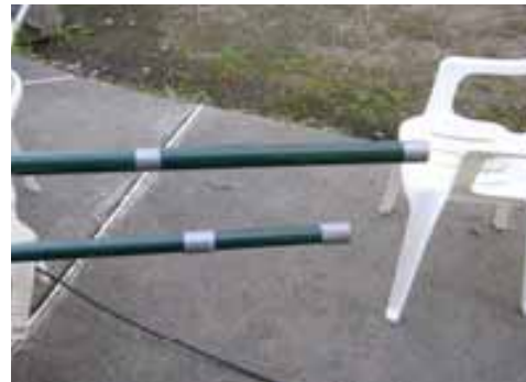
1" PVC and 1-1/2" PVC Wrapped and Ready For Assembly

Step 3. With the 1" PVC section, wrap a second section of the PVC with duct tape between 9-1/2" and 11-1/2" from the bottom. Note: Use enough duct tape to ensure a good telescoping fit is created between PVC sections when assembled.