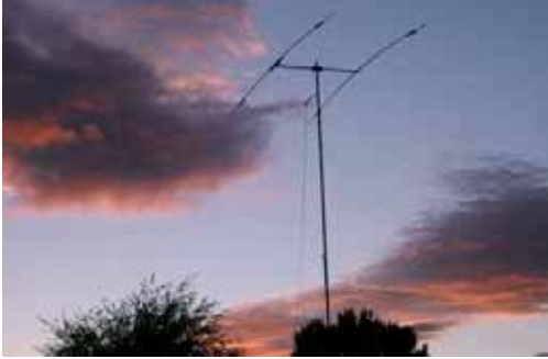
Two-element triband at G0OXO before the storm.