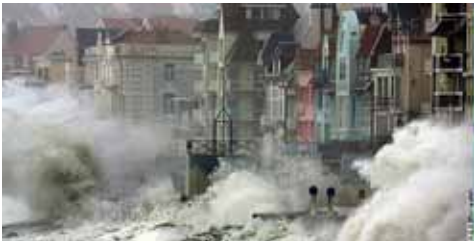
Storm batters Brighton.