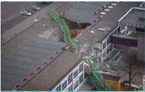
Tower crane toppled by winds in Europe.