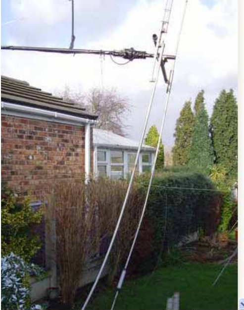
Same antenna after the storm. Sustained winds were clocked at 57 mph.