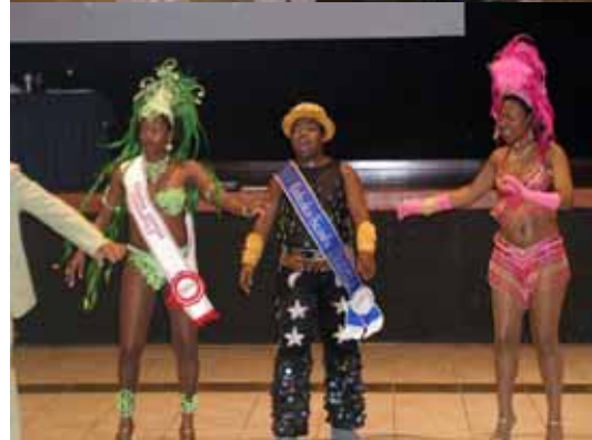
WRTC closing party.