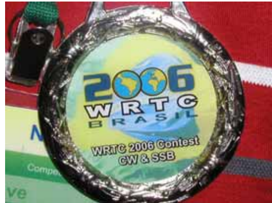
Silver medal for N6MJ and N2NL.