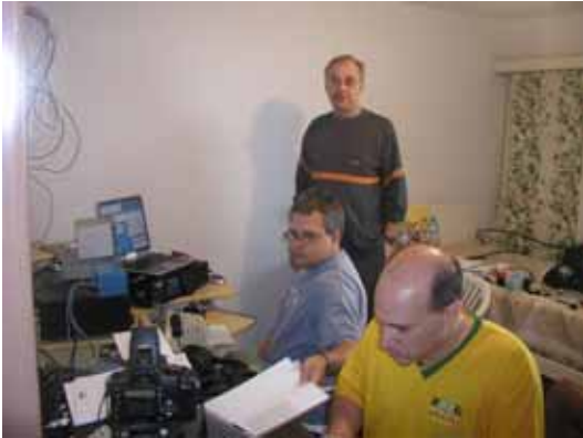
PT5U getting started.