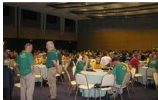
Competitors and referees meeting. (photo EY8MM)