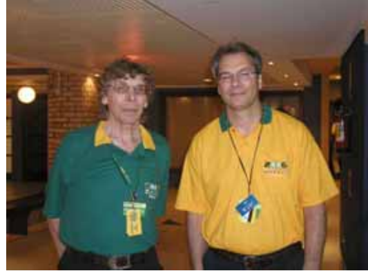
SM3CER and W2SC.