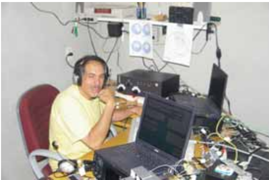
N2NT in the heat of battle.