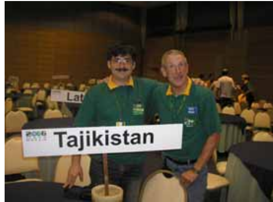
EY8MM and W6OAT.