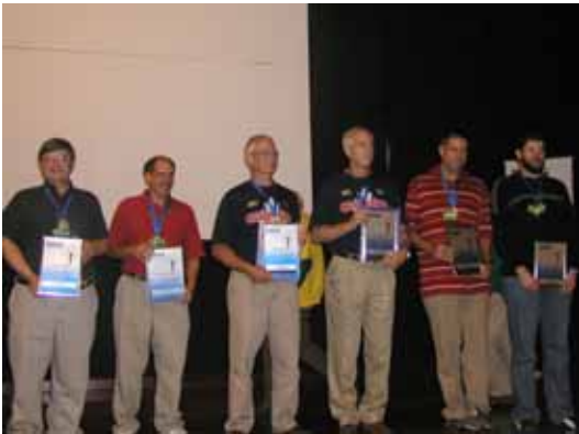
Bronze (K1DG/N2NT); Gold (VE3EJ/VE7HO); Silver (N2NL/N6MJ)