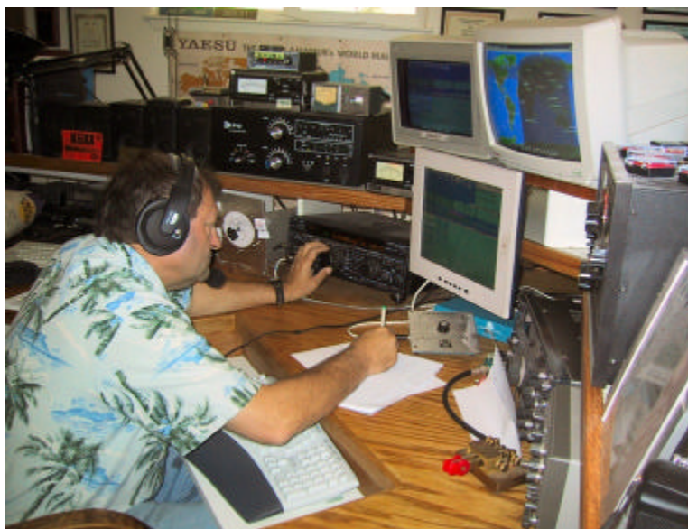
Barry NR6S operating ND6E@K6XX

I have an Excel spreadsheet with all the data from 1993-2002 (including sweeps, clubs, schools and QRP) if anyone is interested in a copy. The data was collected from the 1998-2002 issues of the CQP Commentary plus an email from AD6E for 1993-1997.